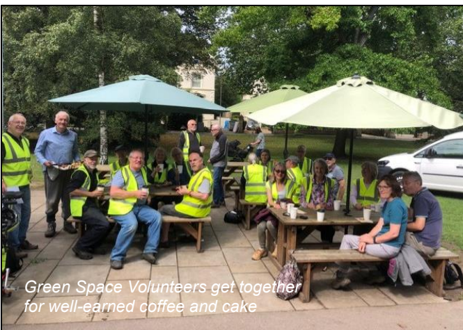
Green Space Volunteers get together for well-earned coffee and cake

In the first six months of this year the Green Space Volunteers contributed 464 hours of work in the park with an average of 18 at each working party.